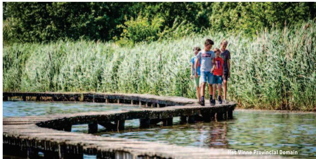
Het Vinne Provincial Domain